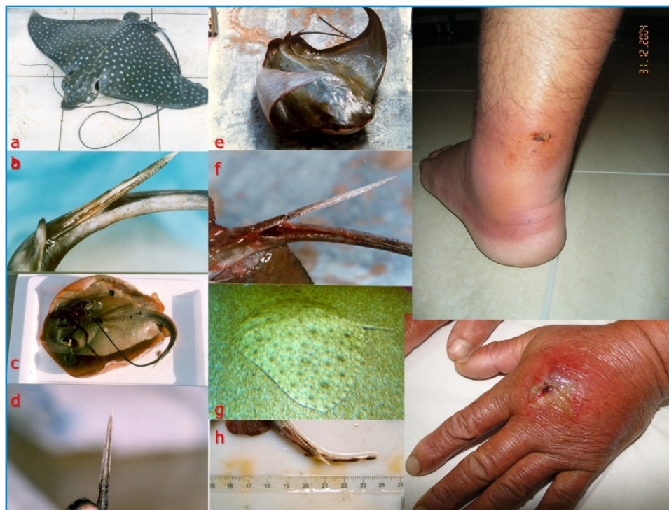
FIGURE 1: Left: a. Aetobatus narinari , the spotted stingray; b. Stinger of the spotted stingray; c. Hypanus sp., the sandpaper or nail stingray; d. Stinger of Hypanus stingray. Central images: e. Rhinoptera bonasus , the cownose stingray; f. Stinger of the cownose stingray; g. Gimnura sp., the butterfly or butter stingray and h. Stinger of Gimnura stingray. Right: envenomations caused by marine stingrays.

Marine stingrays are a type of cartilaginous fish characterized by the presence of one to four bone-like stingers positioned in the caudal region and made of vasodentine ( Figure 1 ). Stingrays are benthic fish, and injuries are common when a victim steps on the animal, which whips its tail as a defense mechanism. This can result in deep penetration of the stingers, which can reach 20 cm in length in some stingray species. However, in Brazil, injuries caused by stingrays primarily affect professional fishermen, for example when separating fish and shrimp in nets or when removing hooks. Meanwhile, stingray injuries are rare among bathers. The occurrence of local tissue trauma is important, as it leads to the disruption of the epithelial sheath, allowing the venom, present in the grooves of the stinger as a thick glandular mass, to flow into the wound 1-7,10,11 .