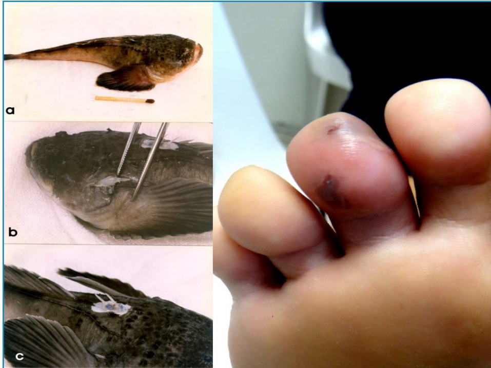
FIGURE 4: Left: Scorpionfish ( Scorpaena plumieri ) and its venom apparatus. Central: Lionfish ( Pterois volitans ) and venom apparatus. Right: envenomations caused by scorpionfish (the last was provoked by a lionfish).