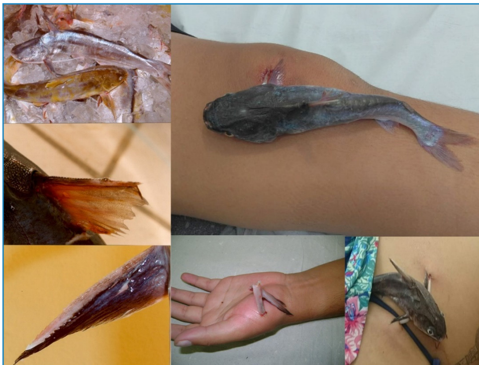
FIGURE 2: Right: Bagre sp. (the flag catfish), Cathorops agassizii (the yellow catfish) and details of the pectoral and dorsal stingers. Right: injuries caused by marine catfish in bathers.

The stonefish, belonging to the genus Synanceia (Synanceiidae family), is renowned as the most venomous fish globally, exclusively inhabiting the Indo-Pacific marine waters. Envenomation caused by these fish results in severe consequences, with numerous reported fatalities attributed to their stings. Envenomations caused by fish from the Atlantic Ocean, in contrast, rarely result in deaths, with reported fatalities usually being associated with subsequent infections 1-7 . The Scorpaenidae family includes highly dangerous venomous fish species, such as Pterois sp. (lionfish) and Scorpaena sp. (true scorpionfish) 1-7,13 . Scorpaena are common in the coastal waters of the country and lionfish, after dissemination in the Atlantic Ocean, are now present in Brazilian waters, especially in the North and Northeast regions of Brazil 14,15 .