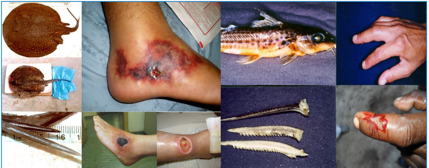
FIGURE 5: Left: Freshwater stingrays ( P. motoro amandae and P. falkneri ), the stingers in the tail and envenomations showing skin necrosis and ulcers. Right: freshwater catfish ( Pimelodus maculatus ), stingers in dorsal and pectoral positions and envenomations/trauma caused by these fish.

Potamotrygon motoro amandae and Potamotrygon falkneri have been reported in the Tietê River, in São Paulo State, where they have not been previously described 22 .